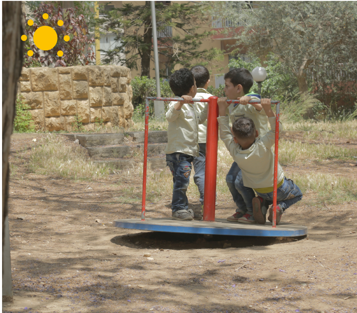
April 2016. Playing during the weekly park trips